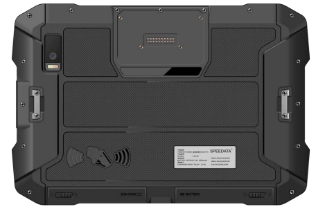
backside of the SD100 Orion Plus